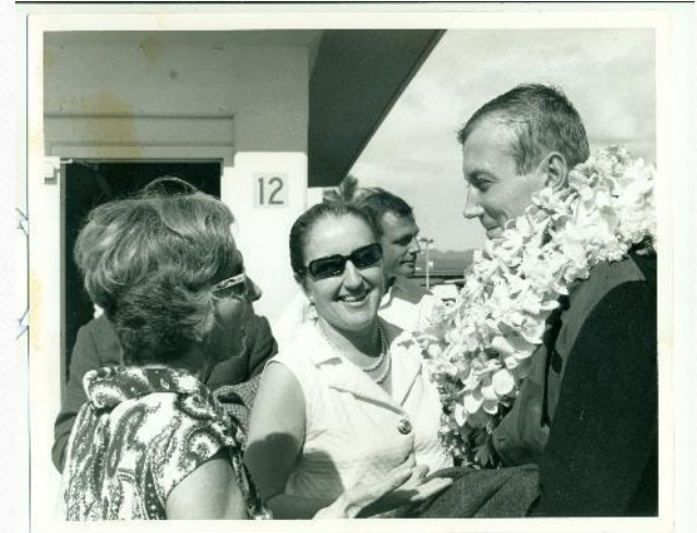
Evgenii Evtushenko 1966

Evgenii Evtushenko, Maxim Shostakovich, Avram Khachaturian, Joseph Brodsky, Victor Nekrasov, Bolshoi Ballet stars, Neva Dance Ensemble Mikhail Baryshnikov, St. Petersburg String Quartet, Moscow Shostakovich String Quartet, Moscow State Circus, Rudolf Nureyev, Alexander Godunov