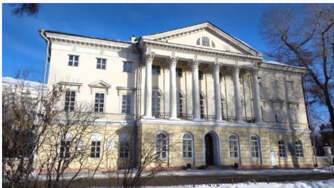
Irkutsk: Belyi Dom, home of Murav'ev-Amursky, Governor General of Siberia, 1847-1861