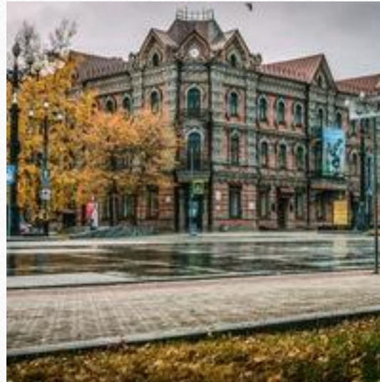
Far Eastern Scientific Research Library